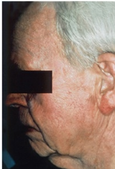
After PDT with Metvix